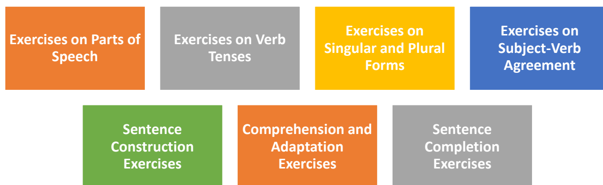
Figure 3. Types of Grammar Exercises

Grammar exercises vary widely, as they focus on different aspects of language learning. Several types of grammar exercises are commonly used in practice, each serving as an effective tool for both understanding grammatical rules and applying them in practice (see Figure 3).